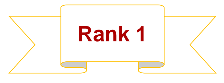
In India - Private