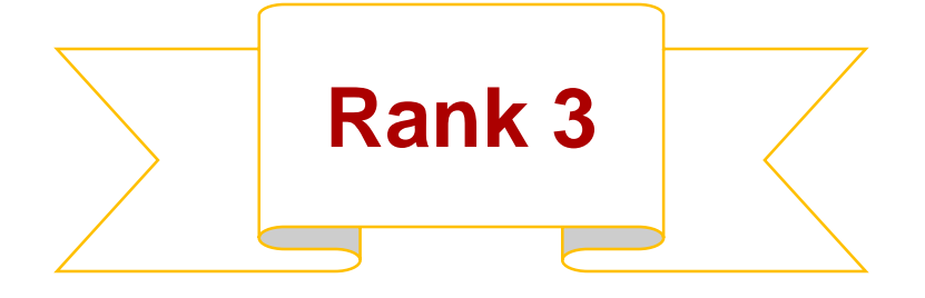
In South India - Overall