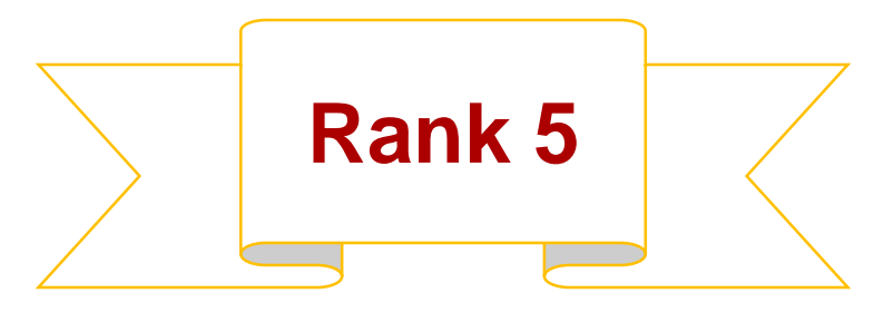
In India - Overall